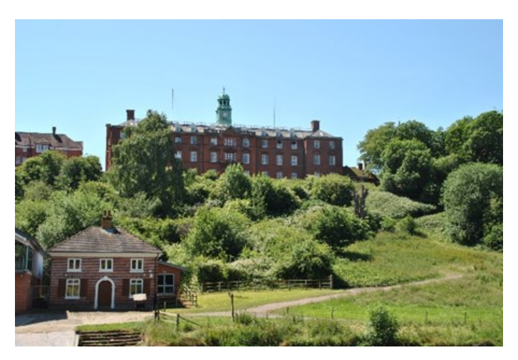
Shrewsbury School/ Picture courtesy of Kate Croft

The talk considered Day's unusual experiment in female education, the involvement of the Shrewsbury Foundling Hospital, and the fate of the girl at its centre, Sabrina Sidney.