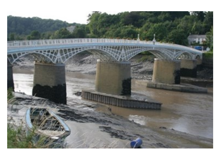
Town Bridge

So two Shropshire reasons for visiting Chepstow, together with Tintern Abbey and the beautiful Wye Valley.