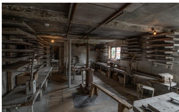
Two images of the old Southern Pipe Factory