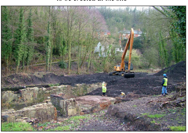
Backfilling in operation. Interpretation panels are to be erected at the site

The site is to be returned to its former use as a picnic area and elements of the remains uncovered will be outlined in the landscaping; interpretation panels will also be erected.