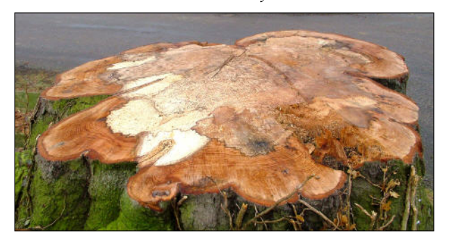
The giant polypore fungus which had infected the Tree can clearly be seen

Readers will have seen the report in the November Newsletter about the splendid beech tree along the Much Wenlock road which had become infected with a fast acting fungus and would have to be felled. Now, sadly, there is a big gap in the skyline since the actual felling took place late last year.