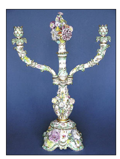
One of the beautiful pieces of Coalbrookdale Ware made between 1820 and

3 April - 22 September 2006 Exhibition of Coalbrookdale Ware.