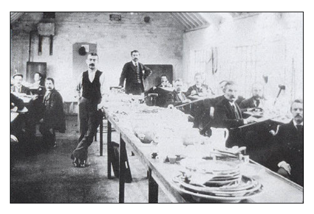
Workers at the Coalport China Works

available for new industries, shops or amenities. This meant that the people preferred to live in neighbouring towns where such facilities did exist.