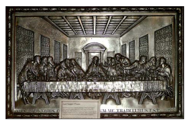
A similar plaque belonging to the Ironbridge Gorge Museum is on display in their Museum of Iron in Coalbrookdale

I am afraid that a little bit of family folklore has crept into the story regarding the frame – there was