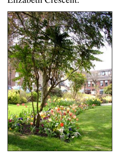
Broseley Memorial Green in all its spring glory. Broseley in Bloom will be holding a Summer Festival here in June

Garden competitions are also being held throughout the town and details on these, as well as entry forms, are available from E Davis and Downes in the High Street and the Weekly Shop in Elizabeth Crescent.