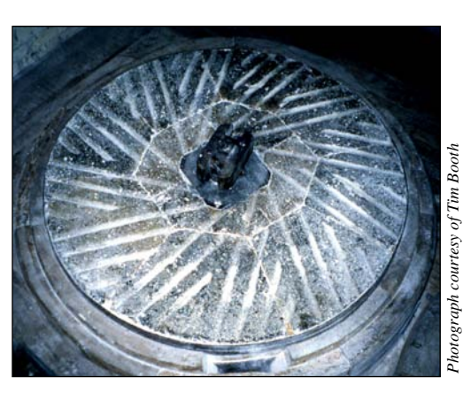
Stones for grinding white flour were built from smaller pieces of French burr stone from the Marne Valley

In the early days, millstones had been made from whatever local stone was available. transport methods improved, stone was shipped in from other parts of the country, the most popular being Peak stones brought in from Derbyshire. Because of their abrasive nature, however, these were not suitable for producing white flour. A much better stone for this purpose was the French burr stone which came from the Marne Valley in northern France. Unlike those made from Peak stones millstones made from this material had to be built up from small sections, cemented together with plaster and bound with an iron band.