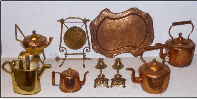
Classic domestic art metal ware made in Birmingham factories

be limited. Conversely, the Berlin Technical Museum and Brohan Museum have superb displays that would set a very good example for Birmingham. We were left hoping that this will happen sometime soon and that Birmingham will hold its head up with more pride as "The Home of Metal"