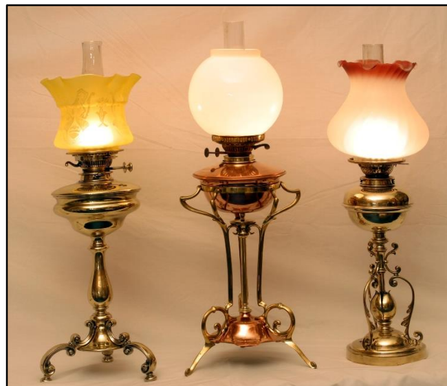
Well-designed oil lamps made in Birmingham

Fortunately, the successful printer, John Baskerville (1706-1775) had built his fine house in a large plot of