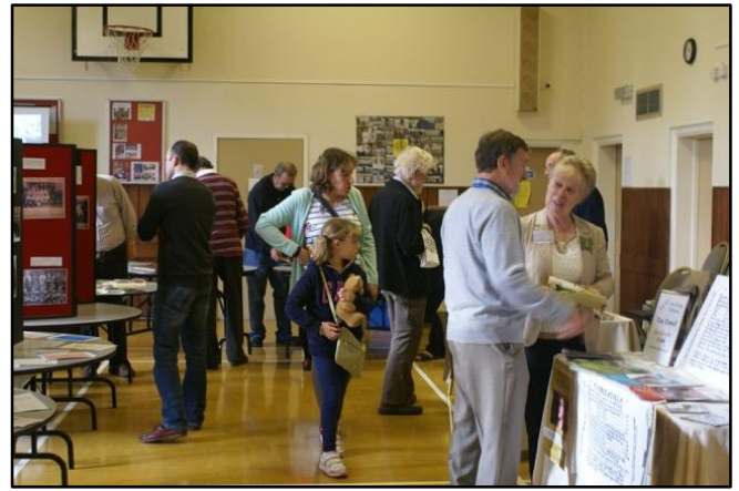
A great turnout for the Open Day

There was a display of the famous Wilkinson coinage which had to be spent in the town. A display on the history of the Victoria Hall itself which was originally built as a meeting place for the Plymouth Brethren showed how little the building had changed over the years.