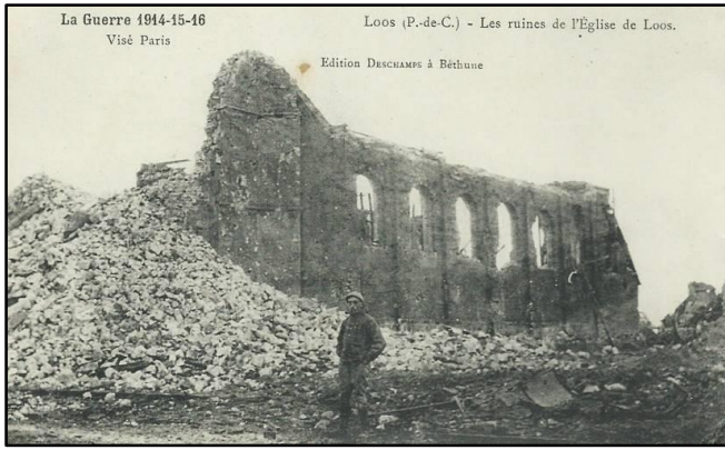
A postcard titled "La Guerre 1914-15-16" (The War 1914-15-16) showing ruins at Loos in France. Loos is just outside the city of Lens

Another series that seems quite brutal today were photographs of burial scenes from the Front; although respectful and quite possibly posed, still, I suspect, not quite what the message families would expect to receive from modern war zones.