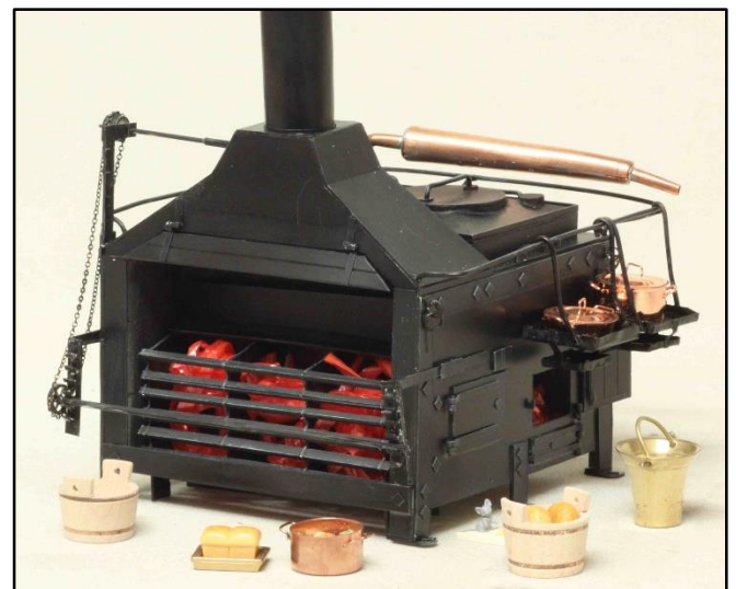
1/12 th replica of the Brodie stove

Brodie stoves were installed in HM ships for over a century until about 1810 when they were superseded by the Lamb and Nicholson stove, patented 1811. This was more fuel efficient and contained three boilers instead of two. This meant that the potatoes could always be boiled separately from the meat and soup. This type of stove can be seen in the galley of HMS Warrior of 1860, afloat near HMS Victory in Portsmouth Historic Dockyard. More information can be found by searching websites on HMS Victory and Brodie stoves.