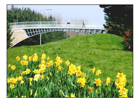
Hall Park Way pedestrian bridge in Telford Town was built using old ironwork from a Telford bridge in the Cound area

The now demolished Cound bridge was built by Thomas Telford