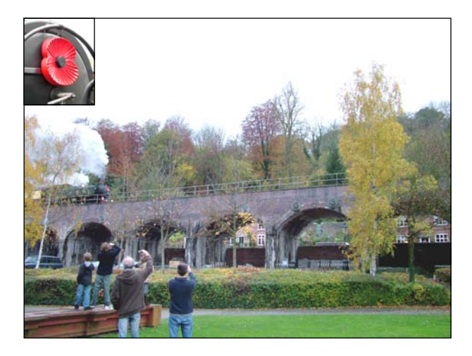
A GWR design pannier tank crossing the viaduct at the Upper Furnace Pools in Coalbrookdale on its return trip from Ironbridge power station Inset, the huge poppy which Ron Miles persuaded the driver to fix to the front of the engine