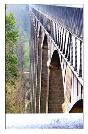
Longden upon Tern, below, was the world's first cast iron aqueduct and possibly the prototype for Pontcycyllte, left

As county surveyor he was responsible for many engineering works throughout Shropshire, in particular the aqueduct at Pontcycyllte, the prototype for which could well have been the Longden upon Tern aqueduct, the world's first cast iron aqueduct.