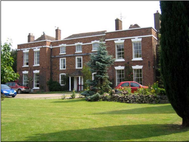
Ketley Hall was one of the places visited on the coach trip

the iron canal aqueduct designed by Thomas Telford and cast at Reynolds' Ketley ironworks.