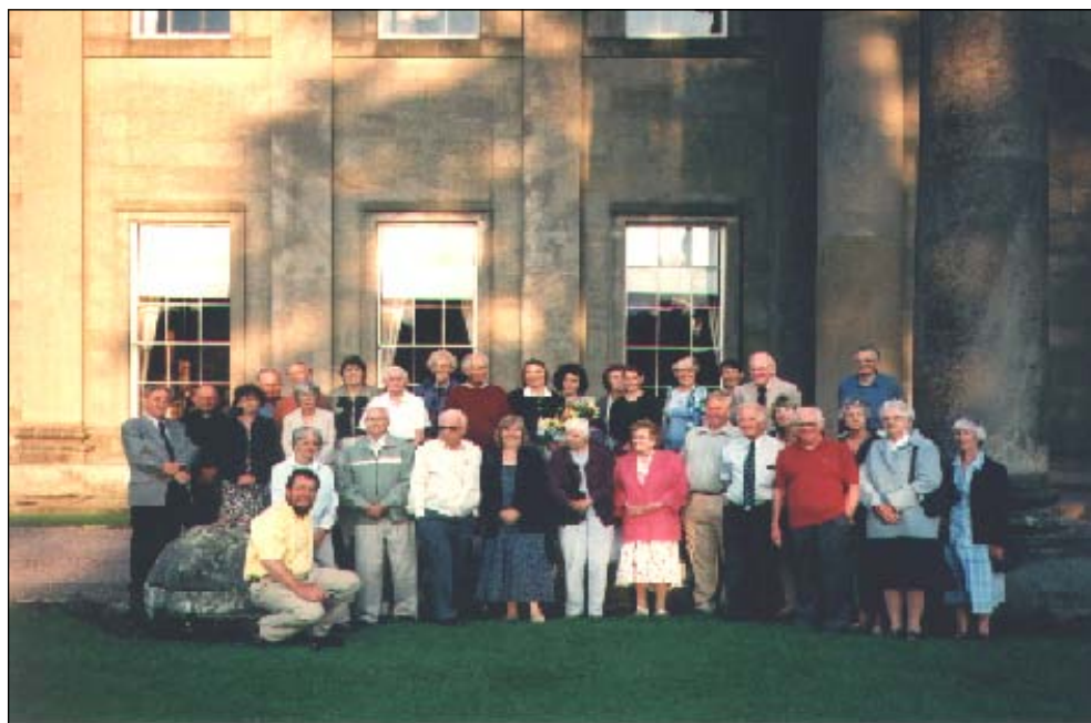
For those fortunate enough to have been given a guided tour of Willey Hall, it was an evening not to be forgotten