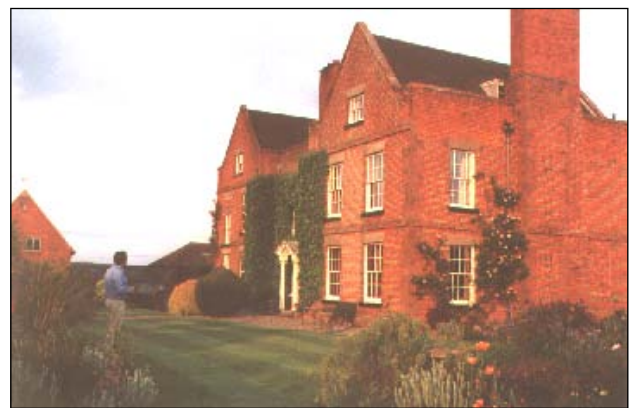
Golding Hall was once the home of the Langley family