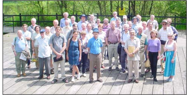
Some of the people who came from all over the country to attend the William Reynolds conference