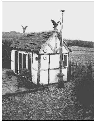
This highly individual summer house used to be a cattle truck

The house itself is set on a hill with stunning views across to Caer Caradoc in the far distance. The gardens, however, are on several levels and are backed by high Elizabethan brick walls which glowed in the evening light. A perfect suntrap, they were happily growing plants normally only seen in warmer climes – we certainly had not expected to see bananas in Shropshire! Nor, come to that, an old cattle truck which the Hartleys had turned into a highly individual summerhouse.