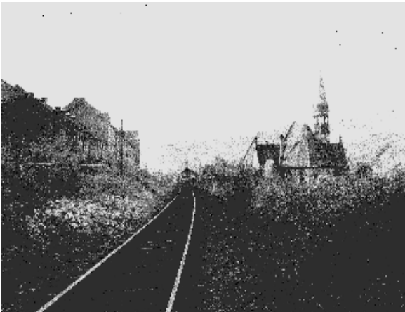
Photograph, c1960, courtesy of Ron Miles

it bounced out of its lock, knocking her into the path of the oncoming train. The other's claim to fame was that it had the widest gates on the old Great Western Railway and a fortuitously sited gatehouse which acted as a buffer to trucks coming too fast round the corner! In common with many other railways, this route was axed by Dr Beeching in 1963.