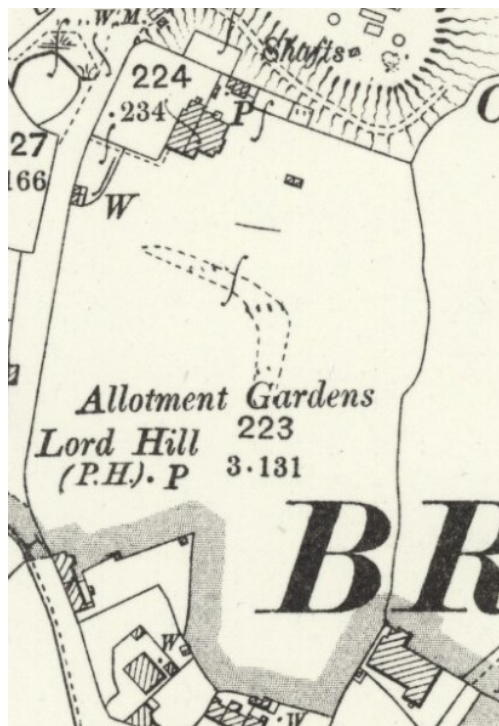
Figure 4: 25" O. S. Map Shropshire LI.2 (includes: Benthall; Broseley; Posenhall; Willey). Published: 1902. The shaft shown in 1882 is now shown as a pump, suggesting it is a well and not a mine shaft.