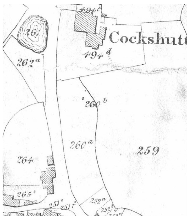
Figure 2: Broseley Tithe 1838. The land was owned by Lord Forester Plot 260b: Coal Pit at Cockshutt occupied by Robert Evans. One shaft is shown, but no buildings. Plot 260b Garden and Rick Yard occupied by Charles Guest

There is no record of the mine working after the auction of 1846; however, the 1882 OS map shows a disused shaft on the same plot but at a different location to the Tithe Map.